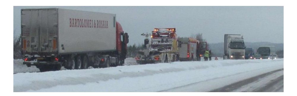
Figure 5 – A EU-Semitrailer Rig Being Towed After Ending in Oncoming Freeway Lane

Granlund & Thomson at International HVTT14 Symposia: Traffic Safety Risks with EU Tractor-Semitrailer Rigs on Slippery Roads